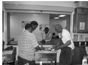
Serving homeless individuals from all over the City of Chicago